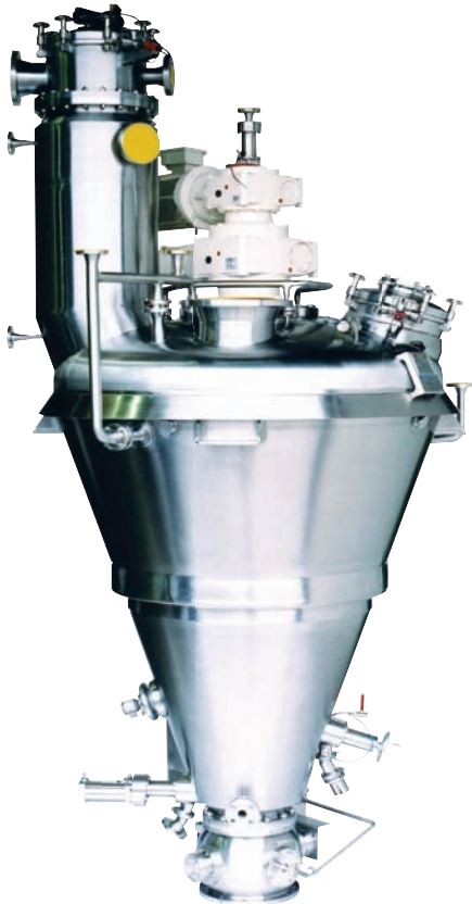
Vrieco-Nauta® Vacuum Dryer